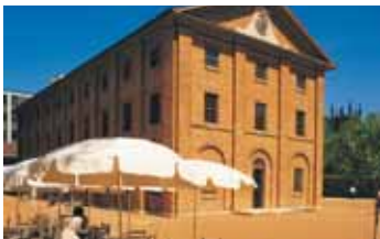
Hyde Park Barracks Museum