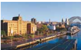
Museum of Contemporary Art