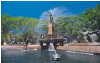
Archibald Fountain in Hyde Park

This self-guided Sydney Arts Discovery Trail is a must-do for culture lovers: